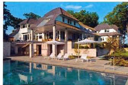
Attie Project in Upstate New York