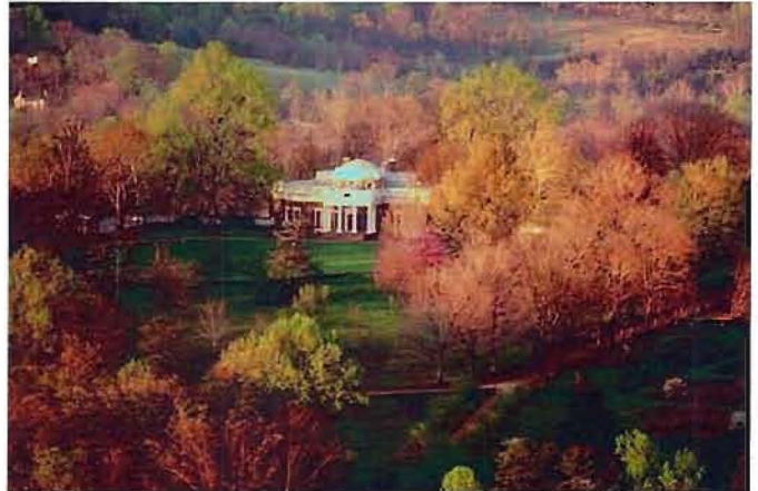
Aerial view of Monticello

Spring '09: A trip down south included a stop at Thomas Jefferson's Charlottesville home, Monticello, as well as colonial Williamsburg. We were struck by the siting of the former, in which a hilltop was essentially sliced off to create a plateau with a spectacular 360 degree view.