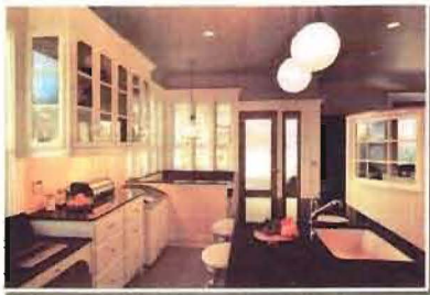
Fresh concepts, familiar setting

"Fresh Concepts, familiar setting" a family-friendly renovation in Old Greenwich "Pools, Pools, Pools" advice on placement, size and so on "The Full Frontal Garage" architectural tips on a suburban staple